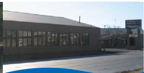
Parks Marina, Sioux Falls