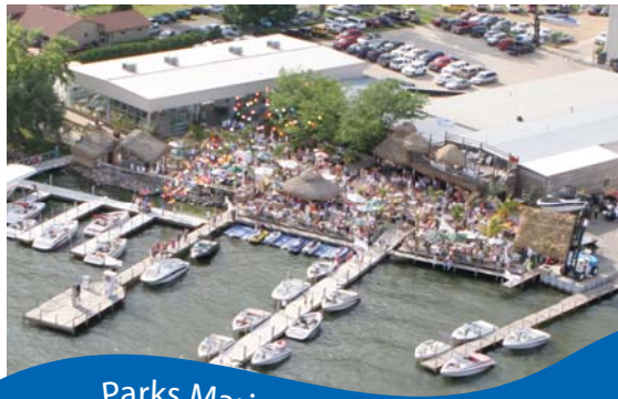
Parks Marina, Okoboji