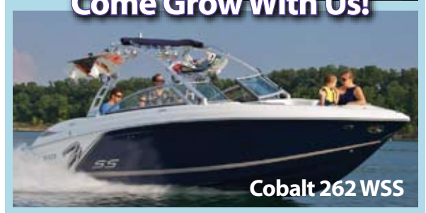
Cobalt 262 WSS